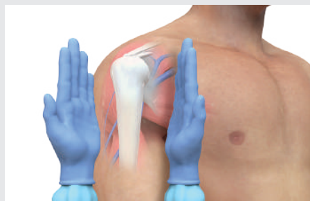
2. With one hand, bisect the arm at the deltoid. With the other hand, bisect the axilla anteriorly.