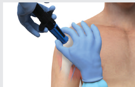
6. With your non-dominant hand, hold the NIO-A by the textured dots and position the device at the insertion site, at a 90° angle to the skin.

PerSys Medical life-saving innovations US: info@ps-med.com | Int'l: info@persysmedical.com www.persysmedical.com