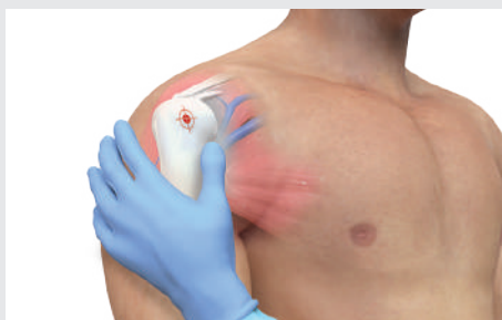
4. Move 1cm (0.5in) towards the greater tubercle.