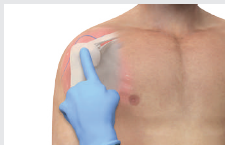
5. Place your finger at the insertion site.