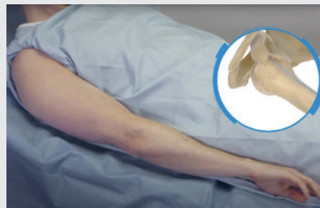
Internally rotate the arm—rotate the hand so the palm is facing outward with the thumb pointing down.