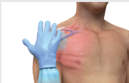
1. Adduct the patient's arm and locate the greater tubercle, next to the head of the humerus.