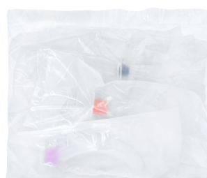
For sizes 000 - 6