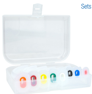
For sizes 000 - 5, Dimensions 13 x 17 x 4.5 cm (L x W x H)

Sets in polybag or transparent and stable storage box