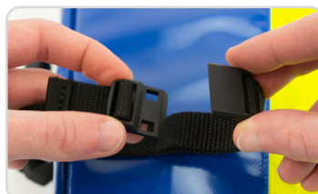
Open: pull off sideways