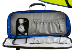
with additional front pocket