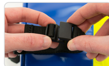
Close: put on straight and let click into place