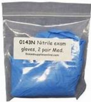
Photo 1 --- Nonsterile Nitrile Gloves in PE bag