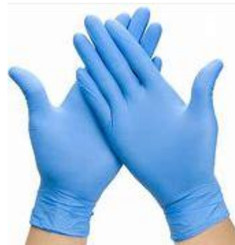
Photo 2 --- Nitrile Gloves