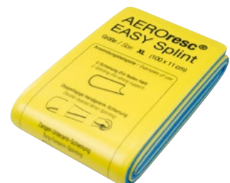
EASY Splint Xtra Large | folded

Measurements: 100 x 11 cm | Weight: 160 g