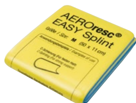
EASY Splint Medium | folded